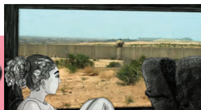
The Bus Trip (still)